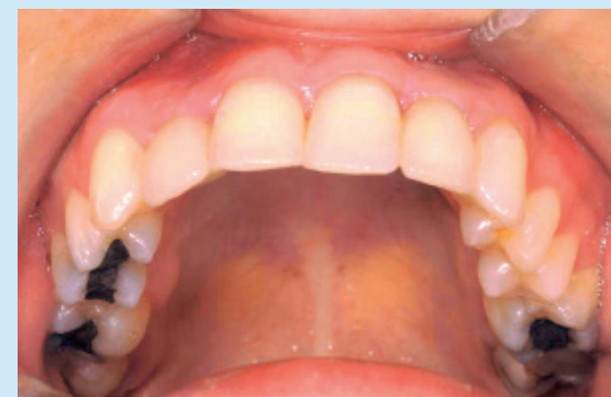
Six months after the widening.