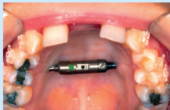
Smile distractor in use.