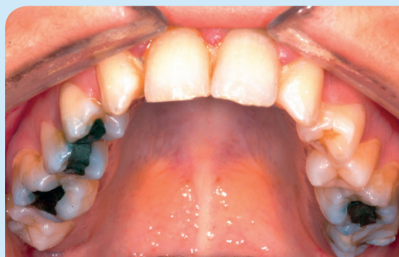
Before the widening.

Turn a quarter until the next pin-hole is present. Do so twice a day.